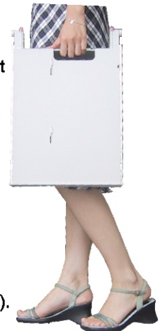
The till with metal-cover (optional) can be taken out to settle accounts in the back office.