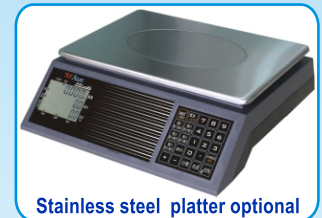
Stainless steel platter optional