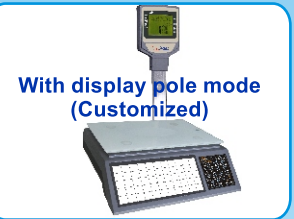
With display pole mode (Customized)