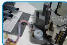
Printer model replacement (P-1)