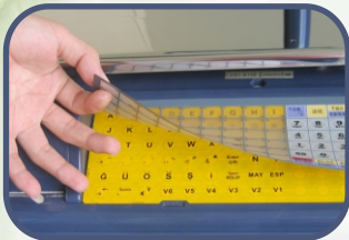
removable and renewable keypad (patent)