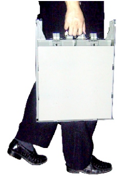
(The drawer core can be taken out to set account in back office)