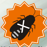
with insert-proof loop design (patent)